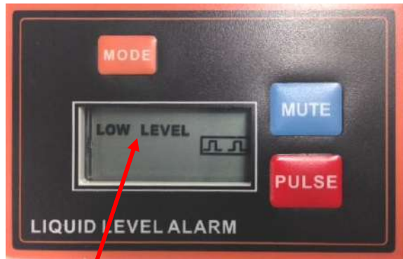
LOW LEVEL alarm mode displayed.

Note: To test for correct operation with the float switch, please hold the MODE button for 20 seconds to alternate operational mode, once released the alarm will sound, when test is completed please repeat procedure to set your required operational mode.