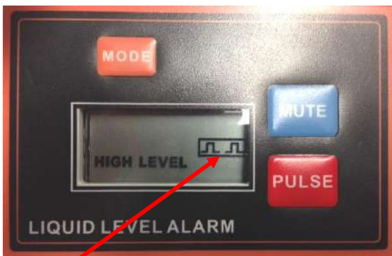
Intermittent audible alarm mode displayed.