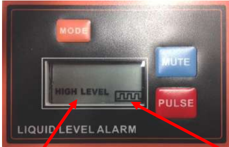
HIGH LEVEL alarm mode displayed.